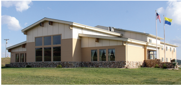
Indian University of North America — where you will live and learn.