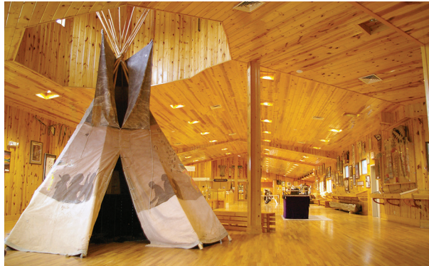
Indian Museum of North America

You will be in nature's playground in the Black Hills of South Dakota. The University is next to hiking and biking on the Mickelson Trail. There are also guided horseback trail rides next door into the Buckhorn Range. Nearby streams and lakes offer fishing, boating and swimming opportunities. Summer also means a variety of special events.