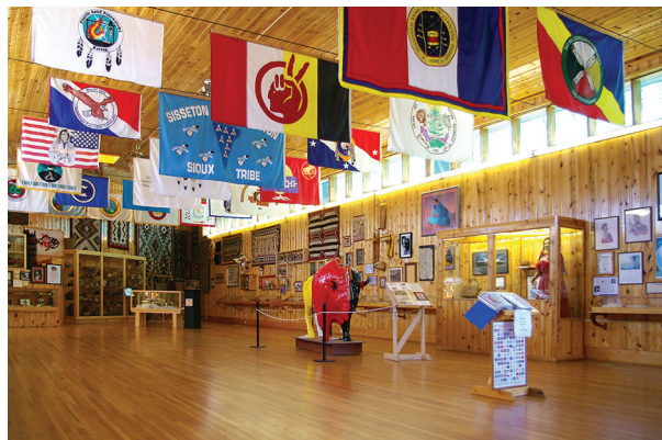
Indian Museum of North America